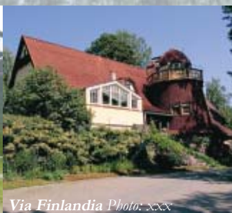
Via Finlandia