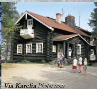
Via Karelia